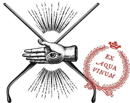
The logo of The Divining Rod wine.

times you may be in the mood for a sophisticated wine, while other times you may prefer something simply hedonistic. In 2012, The Divining Rod , a new wine, needed to build awareness. It leveraged a great image and attention-grabbing packaging to help start a dialogue. This gave it the opportunity to tell its story. Besides making wine, its winemaker also happens to be a dowser (you know, those eccentric people who say they can find underground water using sticks). The brand created a great image with an attention-grabbing logo. Consumers found the logo provocative. Brand spokespeople told a story about the winemaker finding the water needed to plant his vineyards. Whether consumers believed this wild tale or not, they found the image intriguing and the story entertaining, creating an opportunity for the brand to build a relationship. When creating your images, ask yourself, “what story is it telling?”