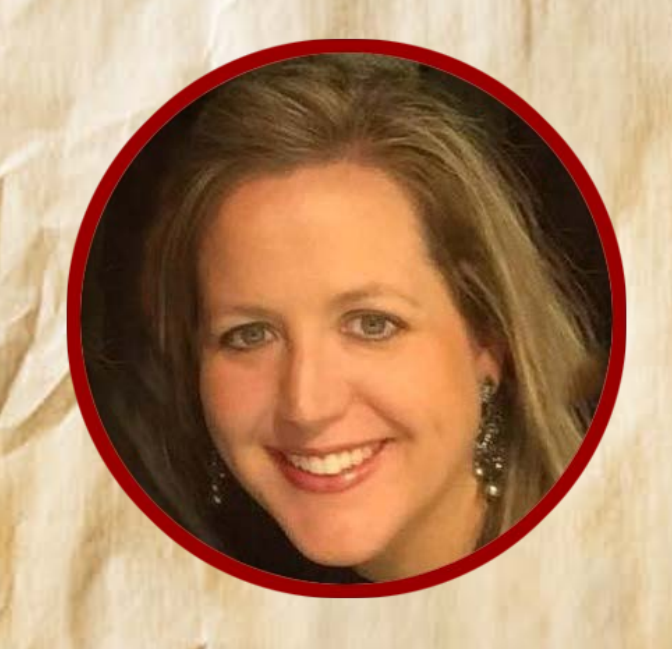
"I lead the Certified Angus Beef <sup>®</sup> brand's digital team and oversee the brand's presence on social media."