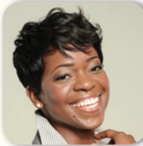
Saptosa Foster 135th Street Agency