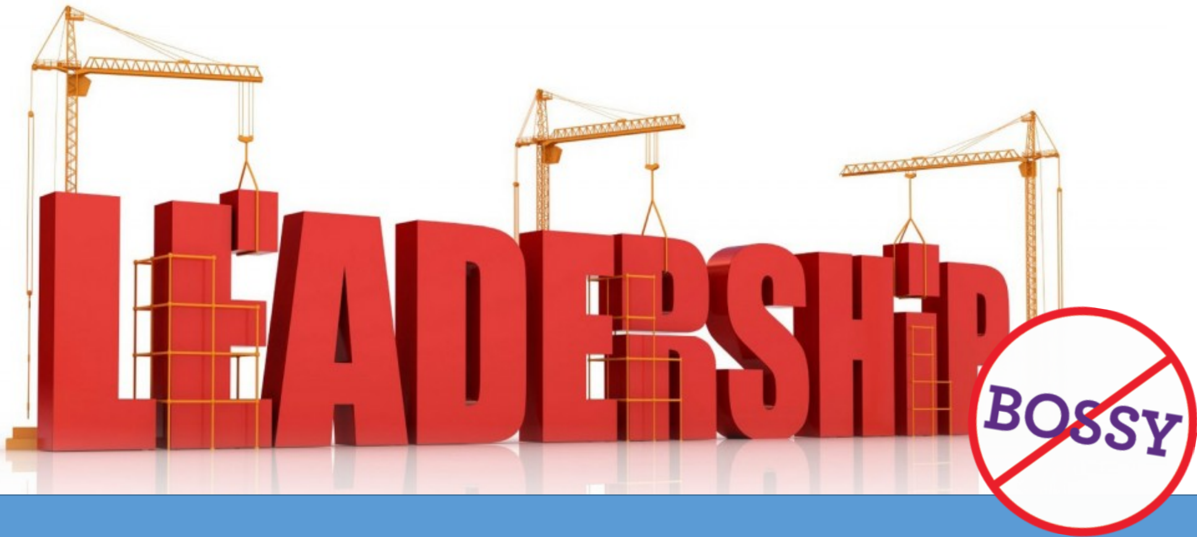
Exhibit LEADERSHIP skills without being bossy