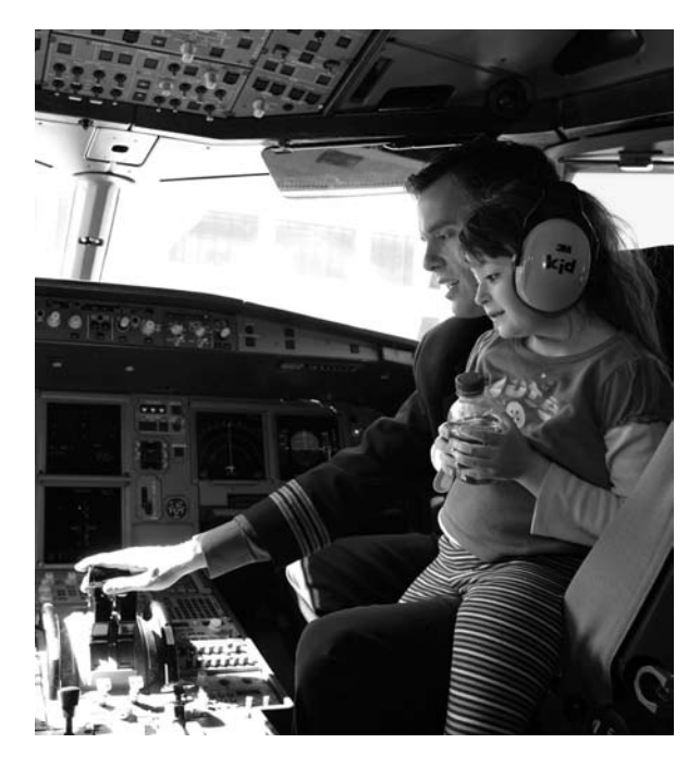
JetBlue and Autism Speaks partnered for the first annual Blue Horizons for Autism event in 2013 at JFK International Airport in New York.

Crewmember stories that highlight a direct impact on customers or other crewmembers are the stories that resonate with media and appeal to and engage followers on social. One example is the Blue Horizons for Autism program. These unique air travel practice events for families touched by autism provide a relaxed setting. This allows them to be better prepared for future travel. The program