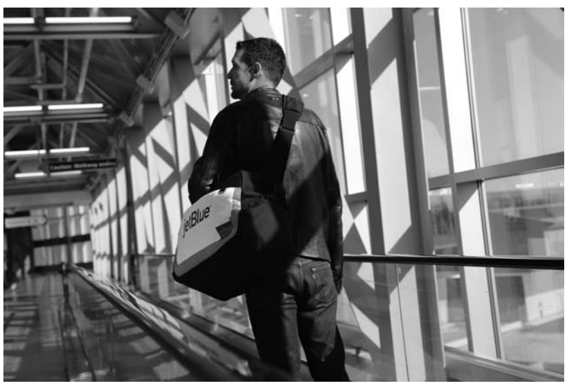
In 2014, JetBlue saved 18.5 tons of fabric from going to landfills and recycled old uniform into chic messenger bags.

When looking at the possibility of getting rid of more than 10,000 uniforms, simply