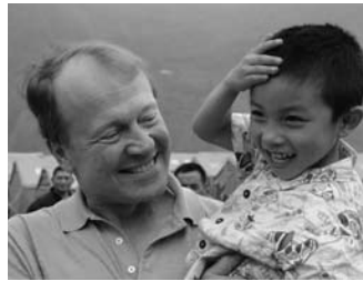
Cisco Chairman and CEO John Chambers visits China's Sichuan Province following the devastating earthquake that hit the region in 2008.

Even in challenging economic times, Cisco Systems has demonstrated continued commitment to CSR and citizenship. Aligning responsible business practices and social investments to create long-term value and sustainability for the company and global communities, Cisco actually expanded its philanthropic efforts in 2009 through straightforward donations and partnering with governments, organizations and other companies. Highlights include: