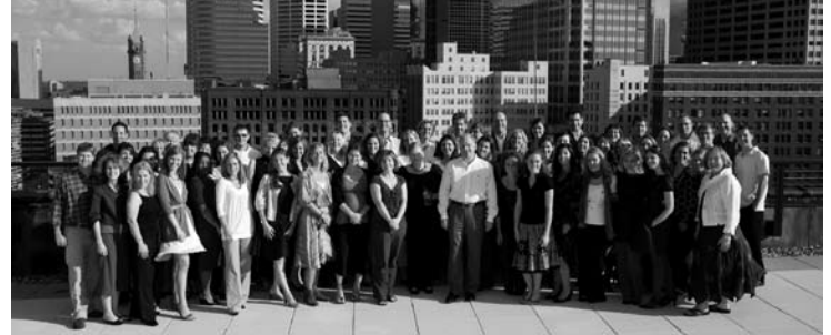
Up on the Roof: Employees from all five CLS offices gather in Minneapolis.

Naturally, CLS lends its communications expertise to assist non-