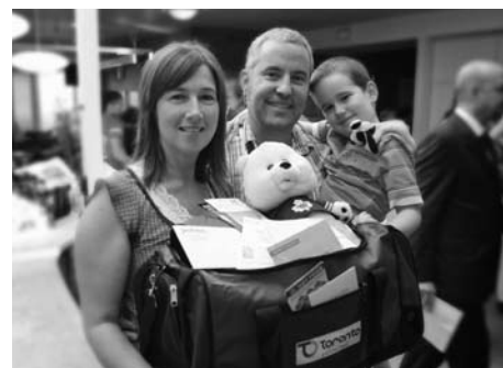
"Relax, Recharge, Renew" gives kids a much needed break from their parents (or vice versa).

More than 150 of Tourism Toronto's member businesses have participated in "Relax, Recharge, Renew" since its inception. The program recently feted its 100th family and