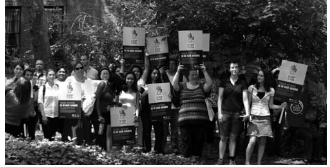
The Body Shop held a rally alongside ECPAT USA and Somaly Mam in NYC to raise awareness for the Stop Sex Trafficking campaign.

To provide immediate support, The Body Shop created the Soft Hands, Kind Hearts hand cream. All proceeds from purchasing the cream are donated to campaign partners to enable them to extend their reach and intervention in providing support for young trafficking victims. In the first four months of the launch, the campaign raised $289,914 for its partners. To date, 629 media outlets have featured stories on the campaign. ■